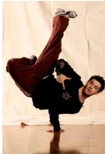
Left: Photo courtesy of and copyright to Urban Seed. Middle: Photo courtesy of and copyright to Western Edge Youth Arts. Right: Photo courtesy of and copyright to Regional Arts Victoria.