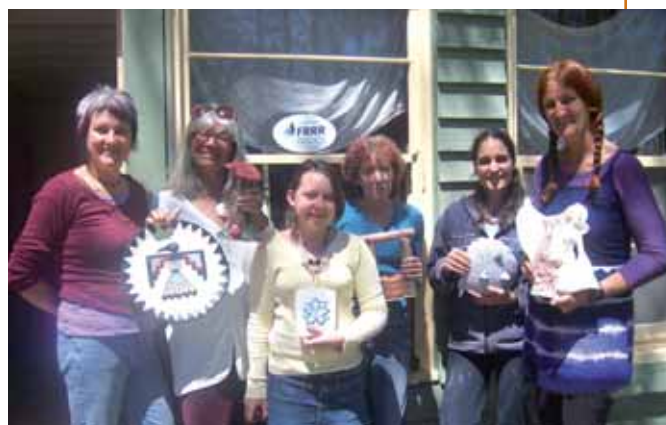
W Tree Promotion and Progress Association which brought together many people of all ages and experience to create a rich array of creative pottery pieces.

In 2007-2008, 24 grants were made using funds from the Ross Trust contribution. Some examples of the grants made are: