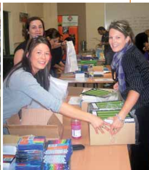
Grocon volunteers assembling education packs at Brotherhood of St Laurence.